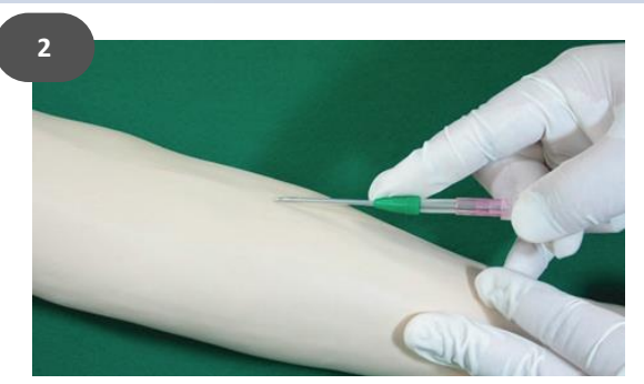
Puncture with the blade of the inner needle facing

Note: Be sure to hold the inner needle hub and take care that the inner needle does not move backward when puncturing.