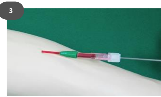
Carefully check and verify the entry of the needle tip into the blood vessel by checking for blood flashback in the needle hub.

\underline{\text{Note}} \colon \text{Replace the needle with a new product when attempting repuncture due to access failure.}