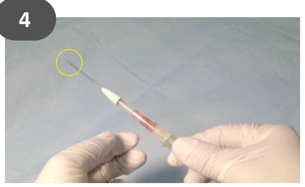
Check the condition of the inner needle tip.