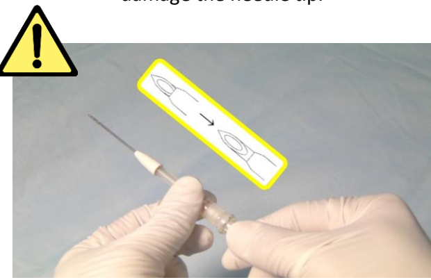
If the catheter tube tip covers the inner needle tip, pull the luer connector back until it touches the hub.