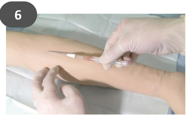
Holding the hub with the inner needle blade directed upwards, aim at the blood vessel, and puncture the skin with the needle.