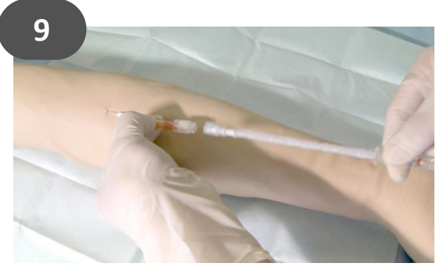
Clamp the center of the clamping tube to prevent any bleeding and promptly pull out the inner needle.