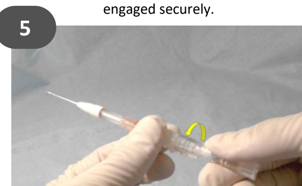
Move the hub counterclockwise to remove any adhesion between the inner needle and the outer needle.