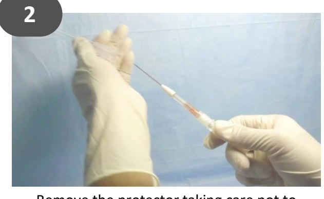
Remove the protector taking care not to damage the needle tip.