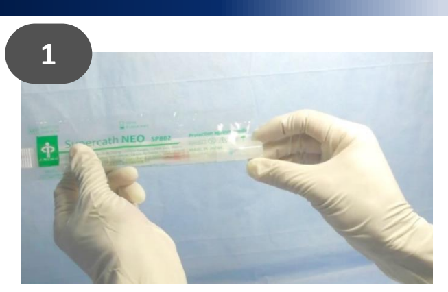
Take the Supercath NEO out.

Safety Fistula Catheter for Hemodialysis